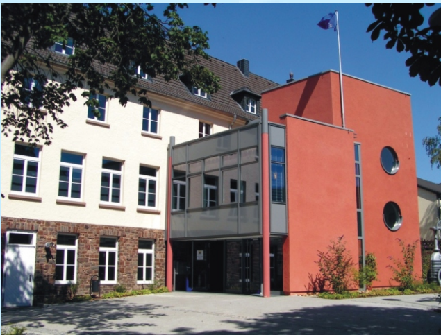
Wasser-Info-Zentrum Eifel (W.I.Z.E.)