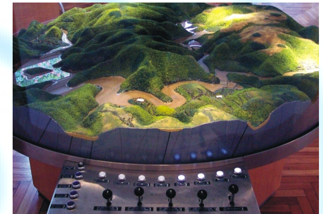
Model of dams with associated reservoirs