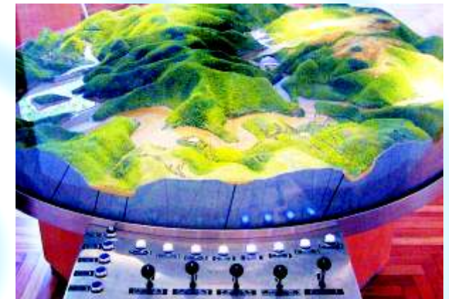
Model of dams with associated reservoirs