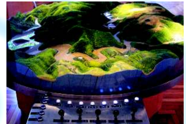
Model of dams with associated reservoirs